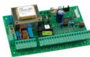
Control board 462 DF Technical specifications page 150