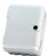
Enclosure mod. L for control boards