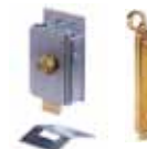
Various accessories page 194