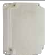
Enclosure mod. E for control boards