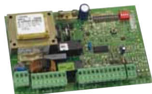
Control board 452 MPS Technical specifications page 148