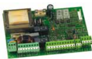
Control board 455 D Technical specifications page 149