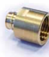
Union for sheath RTA