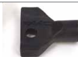
Extra triangular release key (2 pc. package)