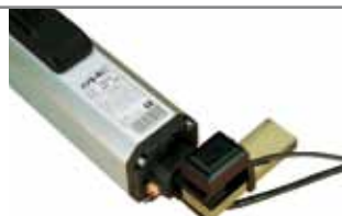
Gatecoder obstacle detection kit (with reversing function) Technical specifications page 161