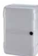
Enclosure mod. LM for control boards